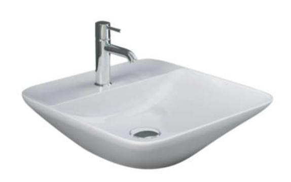
Faucet not included